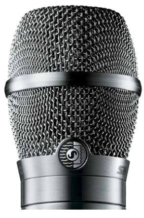
RPW194 KSM11 Wireless Vocal Microphone Cansule (Nickel)