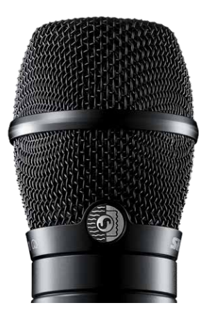
RPW192 KSM11 Wireless Vocal Microphone Capsule (Black)